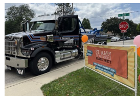
Green Bay Metro Fire Department and Glenn's Towing of Green Bay parked vehicles at the St. Mary of the Angeles Parish Block Party for those who wanted a closeup look.

"It's very nice," she said. "Maybe some people here today will like the church and become members."